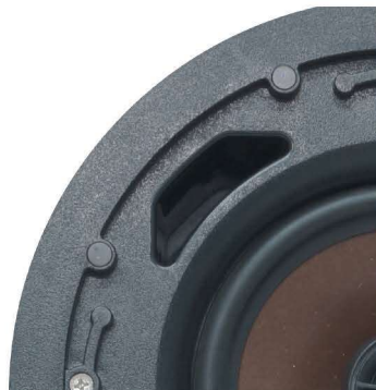
Grille fixation system based on magnet