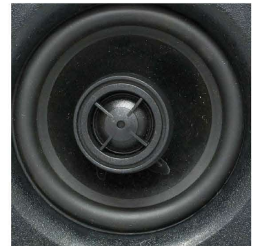
Swivel tweeter. (C PRO 4 and C PRO 6)